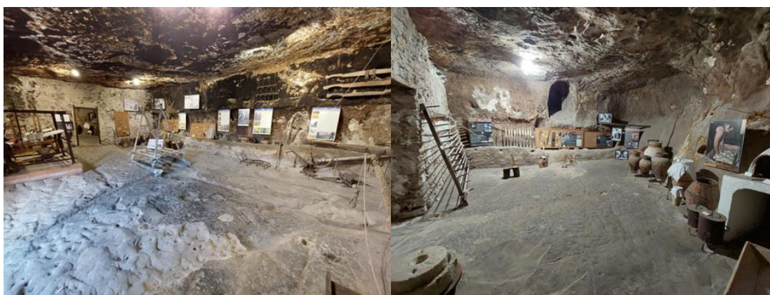
Figure 2. Sperlinga, Museum of Rural Civilization. From the left to the right the first and the second underground chambers with the original objects of peasant work and domestic uses together with educational posters and photographs.

The first focus of the exposition within the castle is the Museum of Rural Civilization, established in 1982 and consisting of an ethno-anthropological museum created at the castle base, in a large 165 m 2 cave, also recovered. The exhibition is organized thematically based on the different production cycles widespread in the country in ancient times, which correspond to the original objects of peasant work and domestic use (Fig. 2). It forms part of the cultural offer included in the castle ticketing. The second focus is the gallery of historical pictures located in the main hall of the castle, the third is the former church, now adopted as a conference hall and to host temporary contemporary expositions.