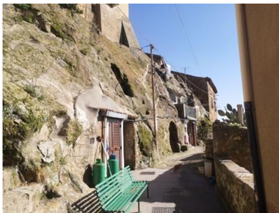
Figure 5. Sperlinga, Eastern district of the village. Troglodyte dwellings still inhabited.