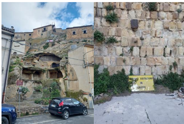
Figure 3. Sperlinga, historical core of caved settlement. Both photos show the signs indicating the historic portion of the village with the troglodyte caves. Picture on the left shows an area recently subjected to a collapse due to hydro-geological instability. In the second picture, the sign was removed due to the area being unusable.

vegetation and closed to the public as well (Fig. 3b).