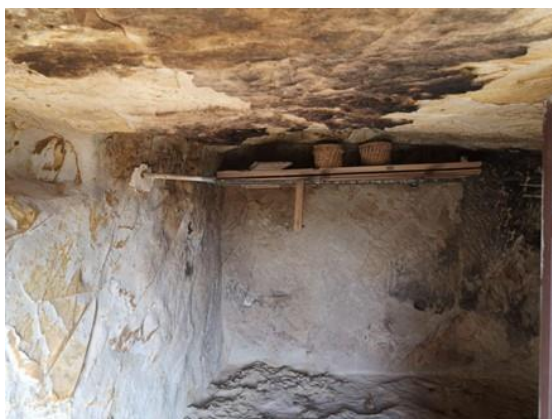
Figure 4. Sperlinga, Eastern district of the village. Collapse risks in the cave for exposition.

On the upper side the municipality arranged a setting that simulates private troglodyte houses with the support of original equipment: pots, fire set, tables and chairs, bed and cribs, also these caves are at risk of collapsing due to the closure of the houses during Covid19 (Fig. 4).