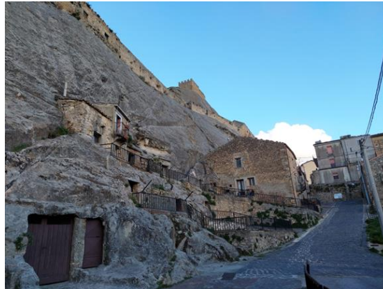
Figure 6. Sperlinga, Western district of the village. The photo illustrates a series of cavities subjected to a variety of historic and contemporary uses.

(red in Fig. 7): the rupestrian castle, included in the defense function, the troglodyte village, included in the living spaces function (Varriale & Genovese; 2023), underground water pipes, channels and the central cistern that can be classified within the water function and several caved stables, carpet factories, shops and other local manufactures adopted to support local economic activities.